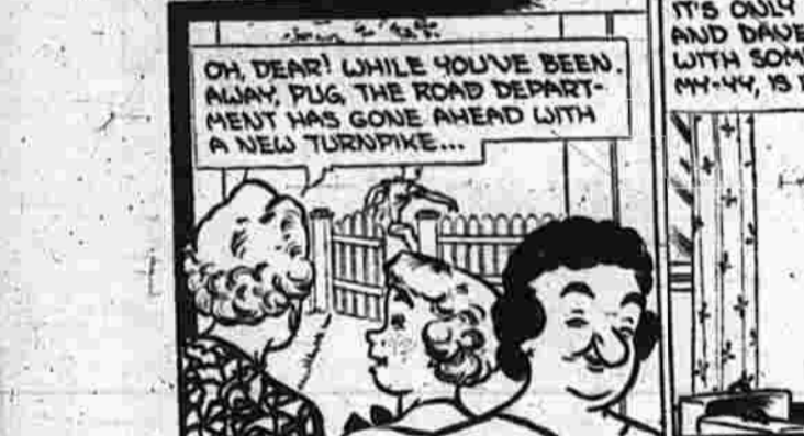
MORTY MEERLE BY DICK CAVALLI