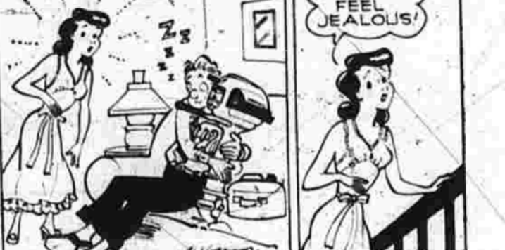
COTTON WOODS BY RAY GOTTO