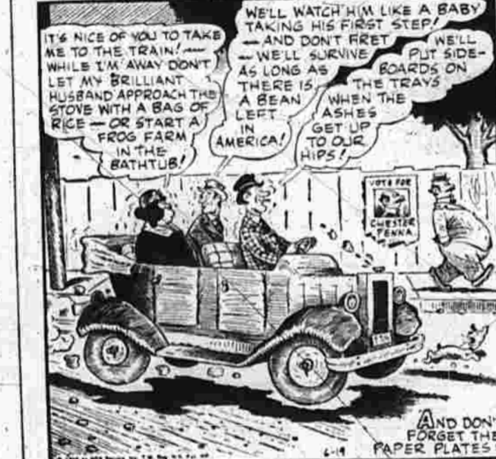
ALLEY OOP BY V. T. HAMLIN