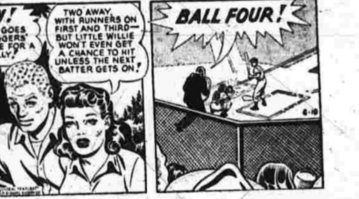
BUZ SAWYER BY ROY CRANE