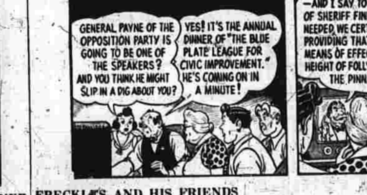
FRECKLES AND HIS FRIENDS BY MERRILL BLOSSER