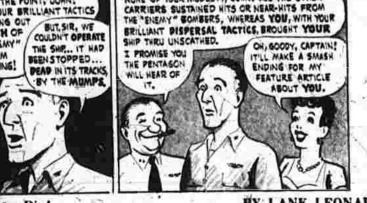
MICKY FINN BY LANK LEONARD