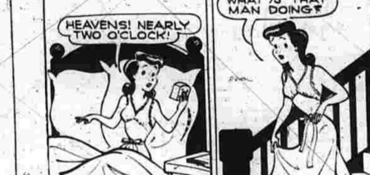
COTTON WOODS BY RAY GOTTO