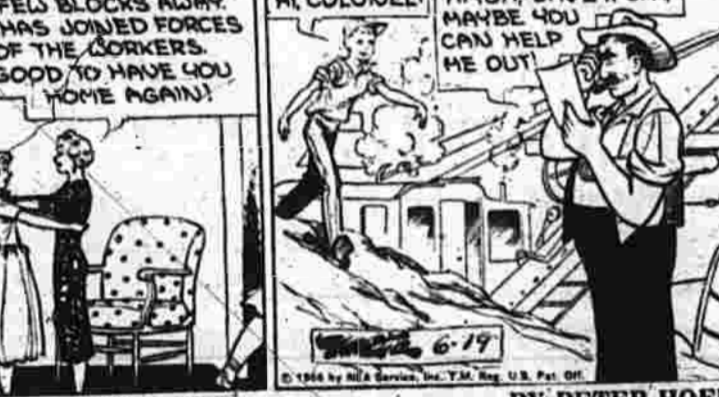
MORTY MEERLE BY DICK CAVALLI